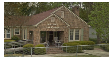
Southern Senior Living 215 E Sellers St 912-383-9883